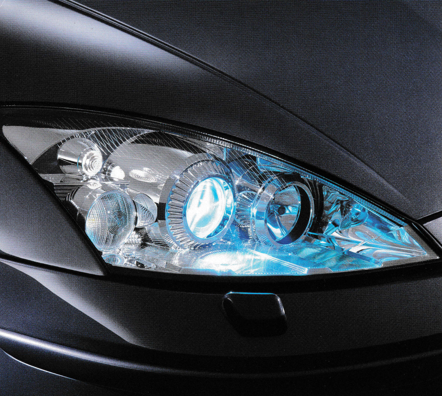
Xenon headlights Provide outstanding levels of illumination. (see Optional equipment)