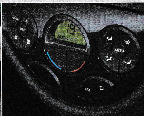
Automatic air conditioning Maintains a comfortable, humidity-free environment. (see Optional equipment)