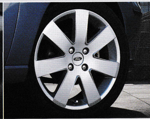
Alloy wheels 17" 7-spoke alloy wheel for added exterior appearance. (see Optional equipment)