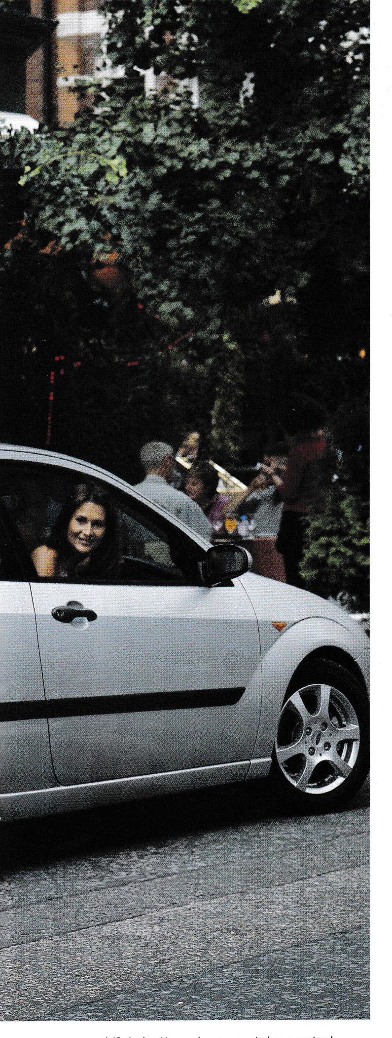
Life's better when you take control