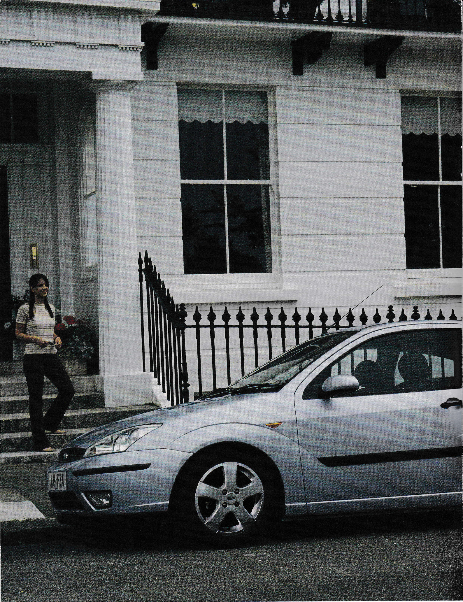
Model Focus Edge Colour Tonic