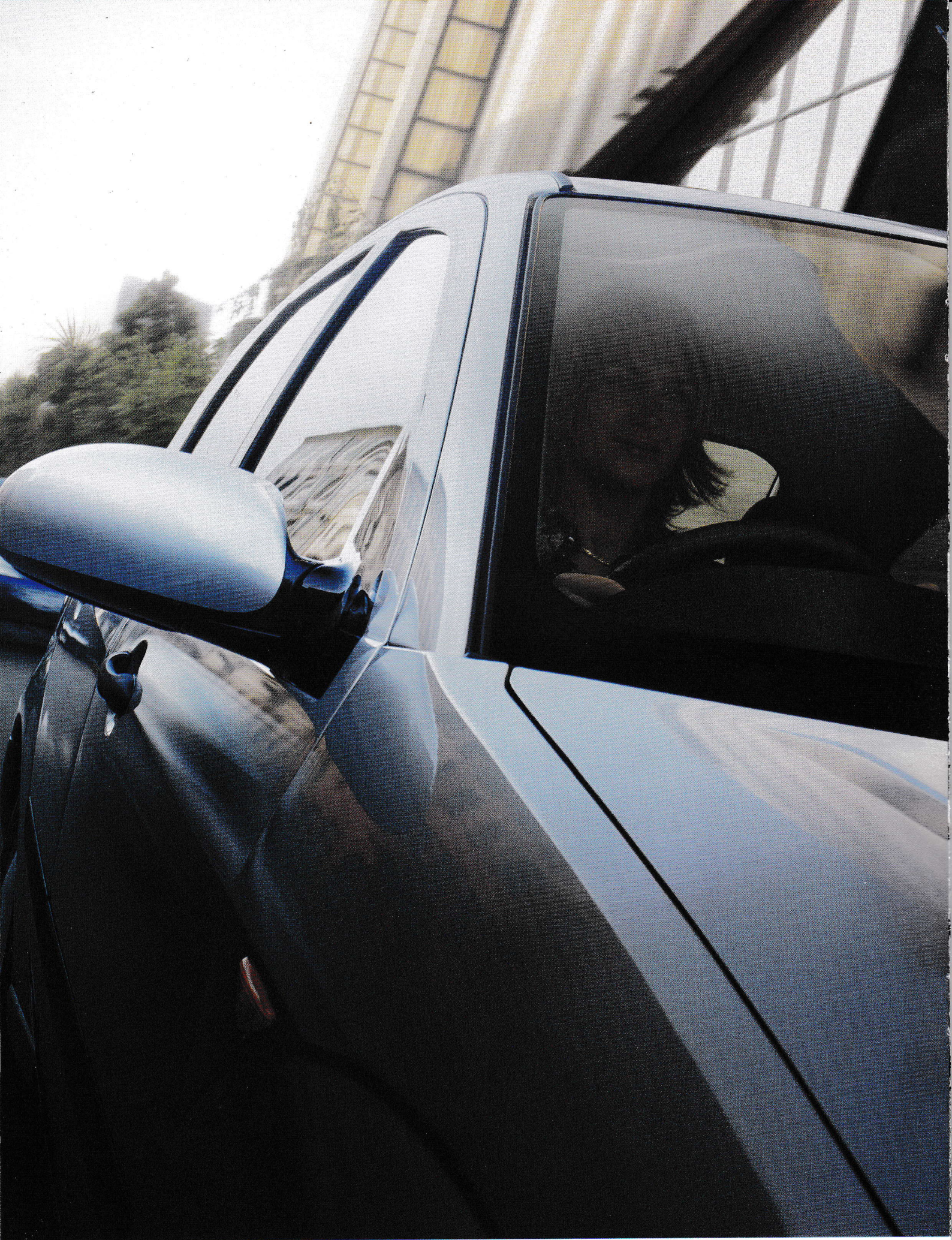
Model Focus Flight Colour Machine Silver