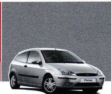
Tonic** Metallic body colour