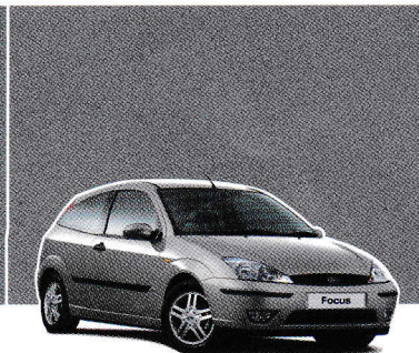
Machine Silver** Metallic body colour