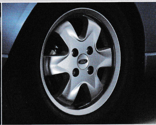
Alloy wheels Optional 15" 6-spoke Star design for added exterior appearance. (see Optional equipment)