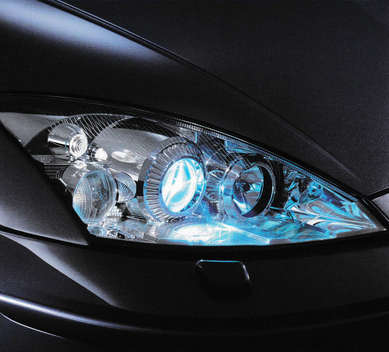
Xenon headlights Provide outstanding levels of illumination. (see Optional equipment)