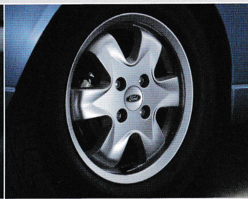
Alloy wheels Optional 15" 6-spoke star design for added exterior appearance. (see Optional equipment)