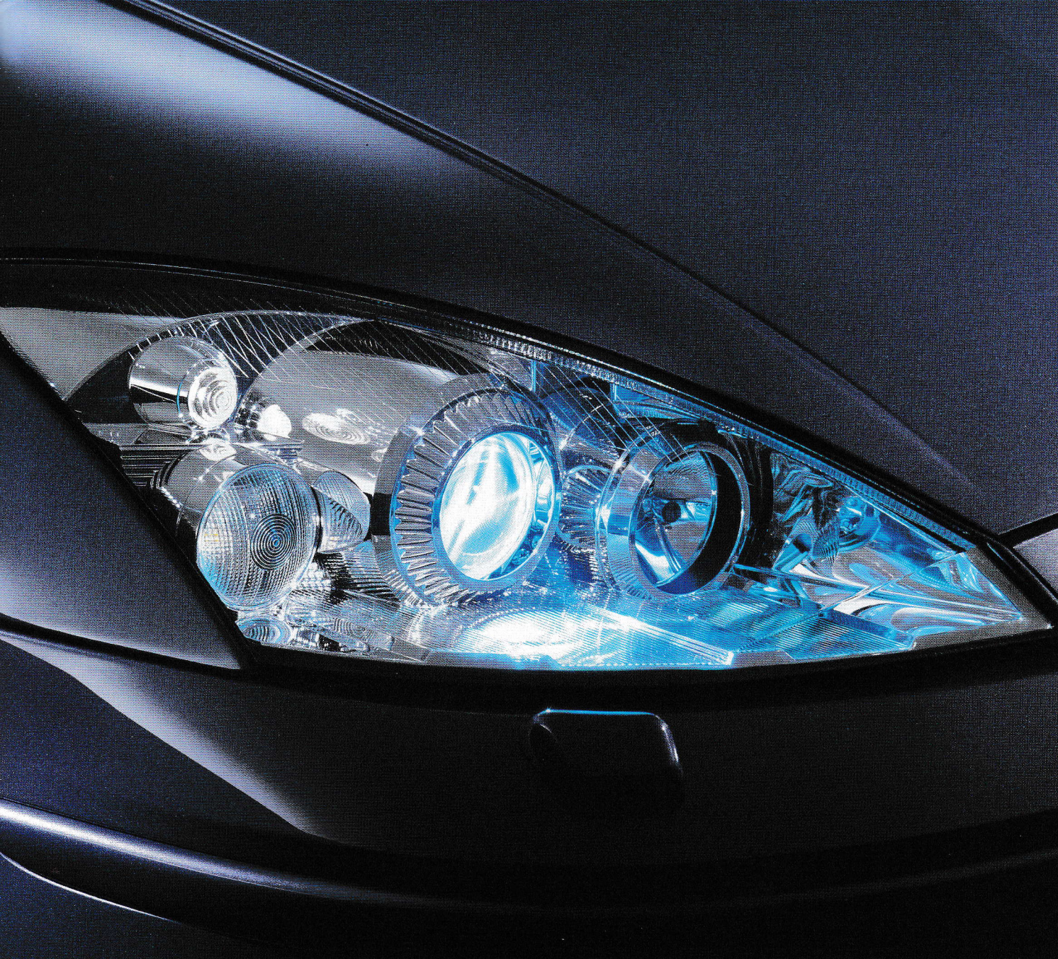
Xenon headlights Provide outstanding levels of illumination. (see Optional equipment)