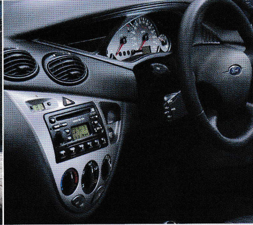
Interior The titanium-effect grey facia and graphite-effect instrument cluster.