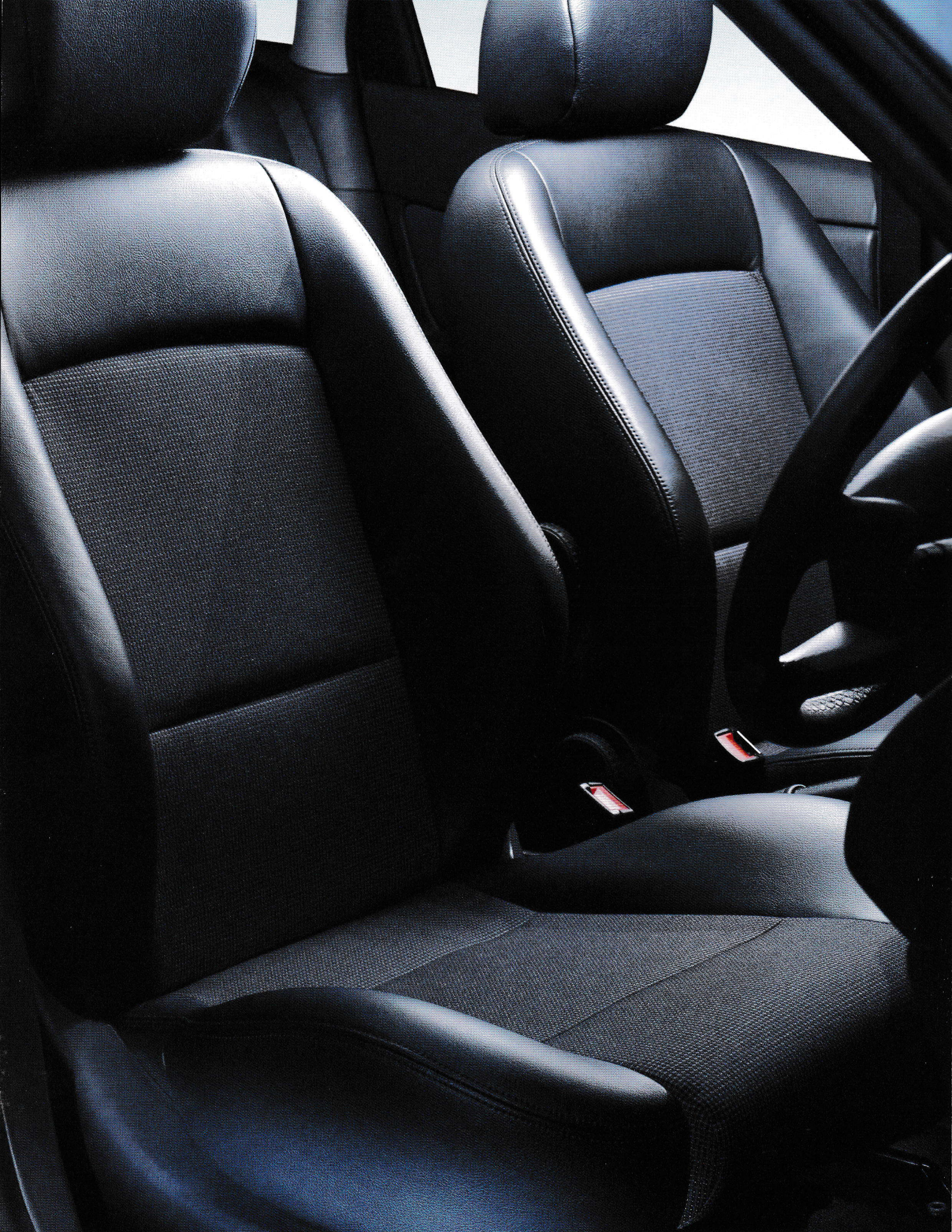
Stylish sports seats with black waffle and partial leather trim.