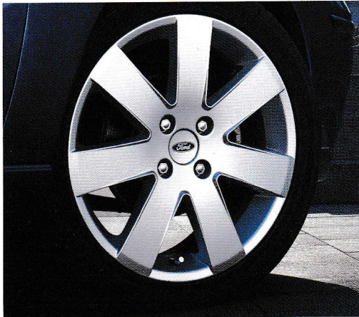
Alloy wheels Focus TDCi Sport features stylish 17" 7-spoke alloy wheels.

Stylish good looks and precision handling are reasons enough to put yourself behind the wheel of the new Ford Focus TDCi Sport; add to that the outstanding power and economy* of its 115 PS 1.8-litre diesel Duratorq TDCi engine and you're in for a truly thrilling experience